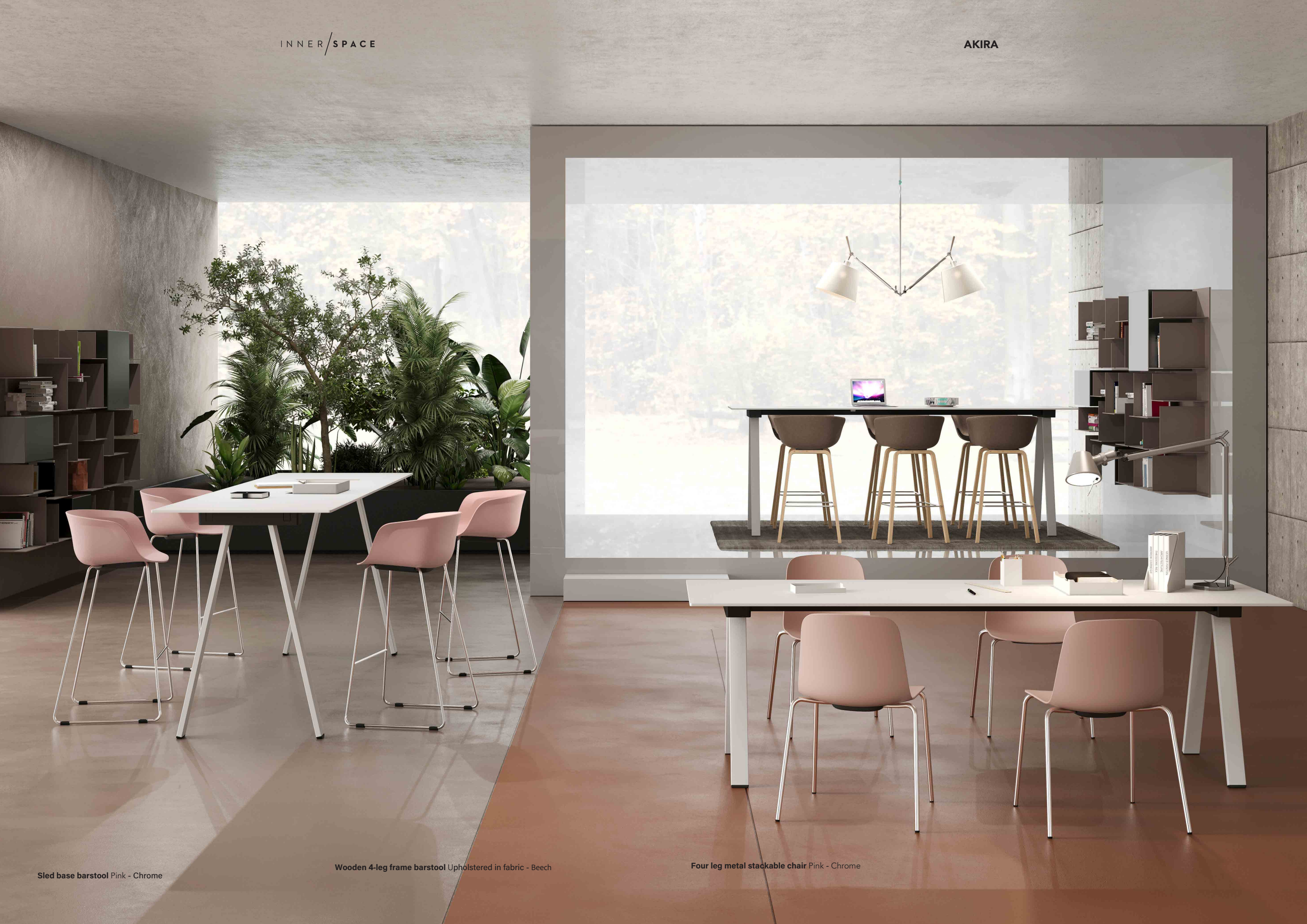
Sled base barstool Pink - Chrome