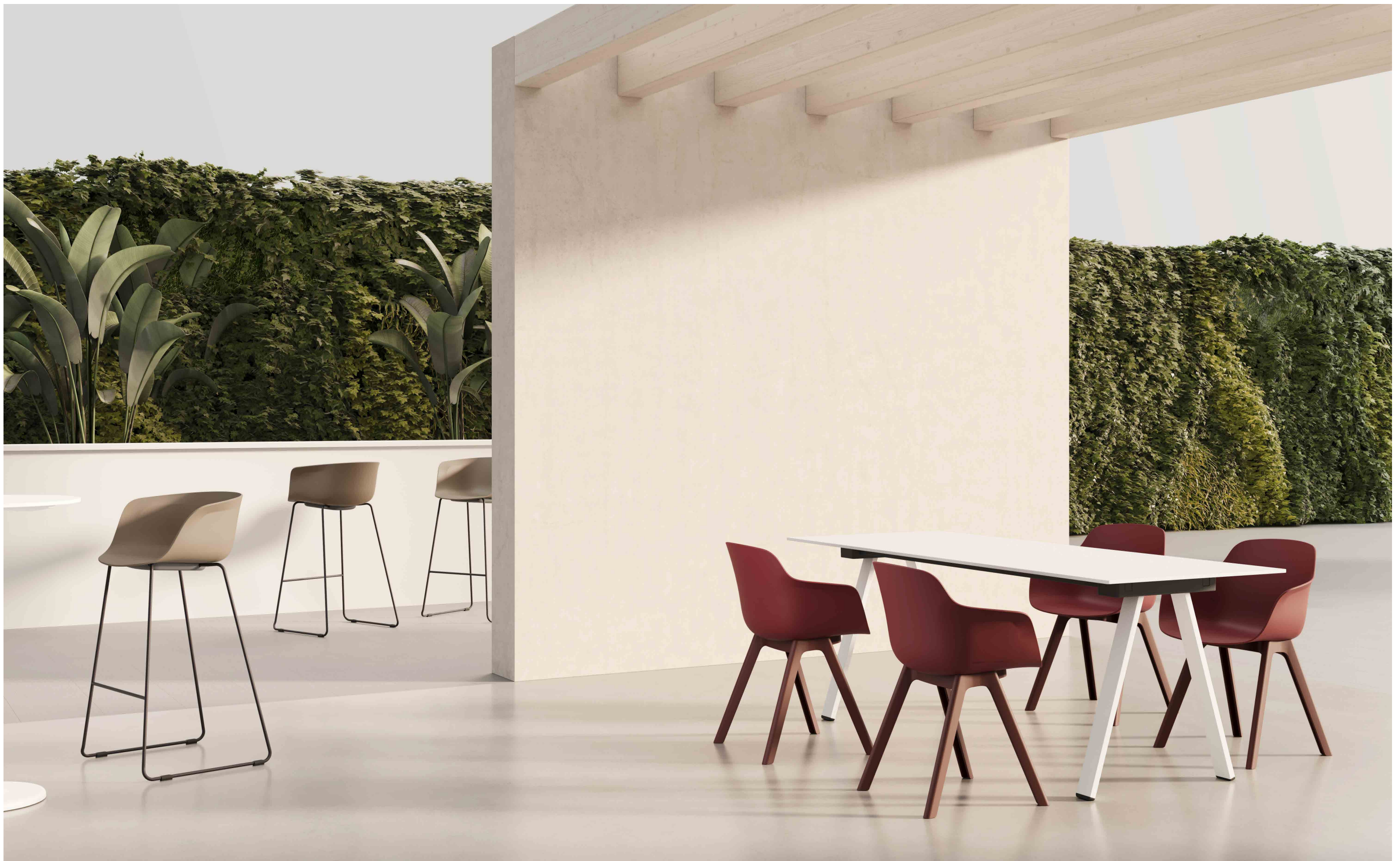
Sled base barstool Sand ECO - Black