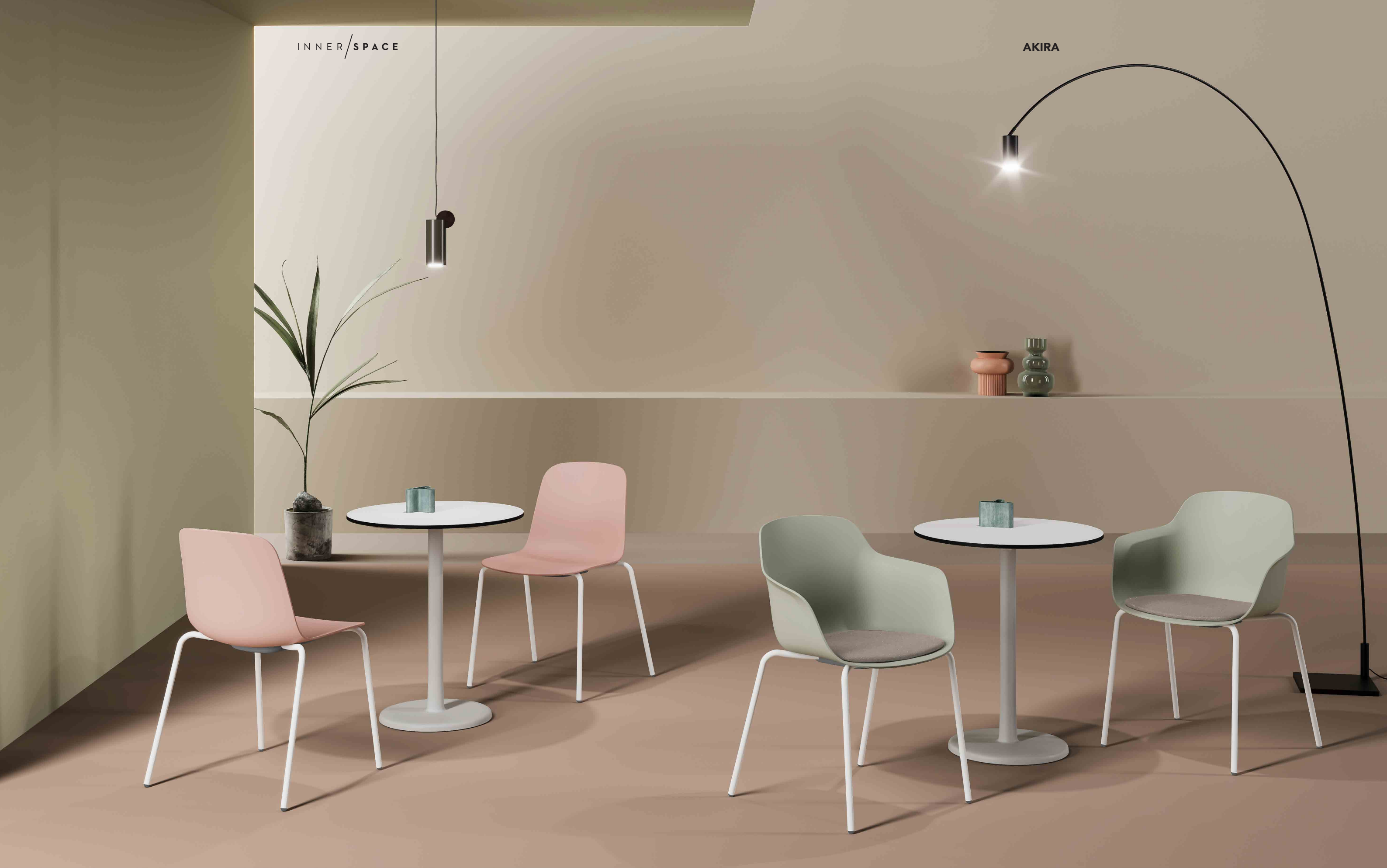
Four leg metal stackable chair Pink - White