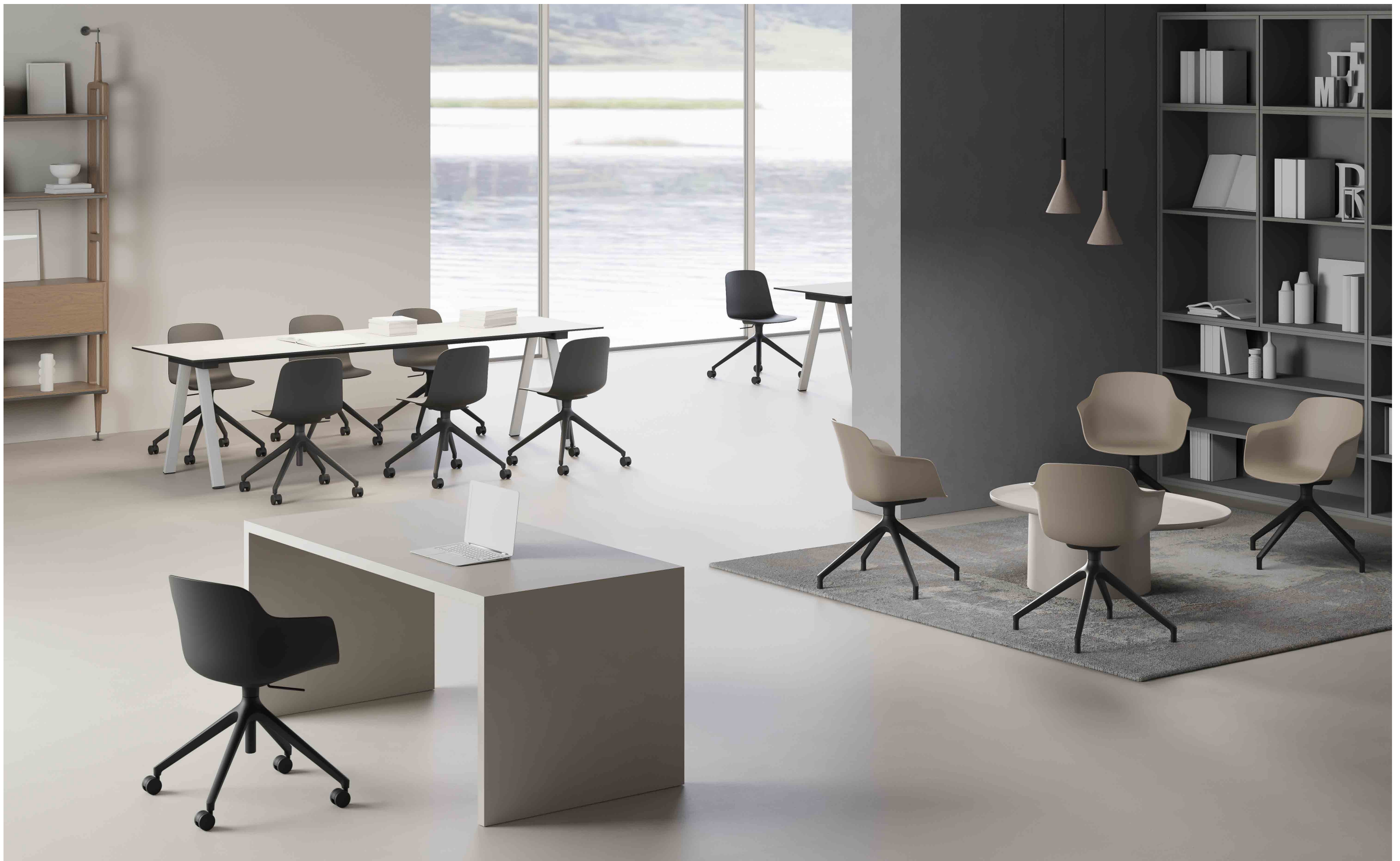
4-star base armchair with gas and castors Black - Black