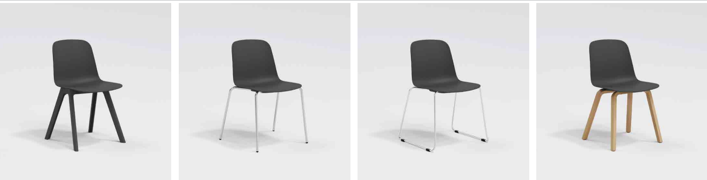
Four leg polypropylene frame Metal four legs stackable frame Sled base stackable frame Wooden 4-leg frame