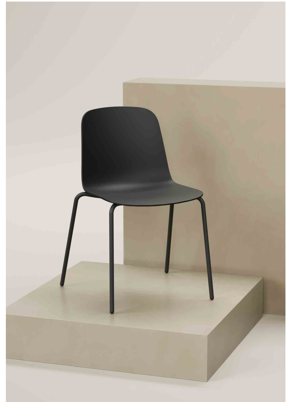
Four leg metal stackable chair Black - Black