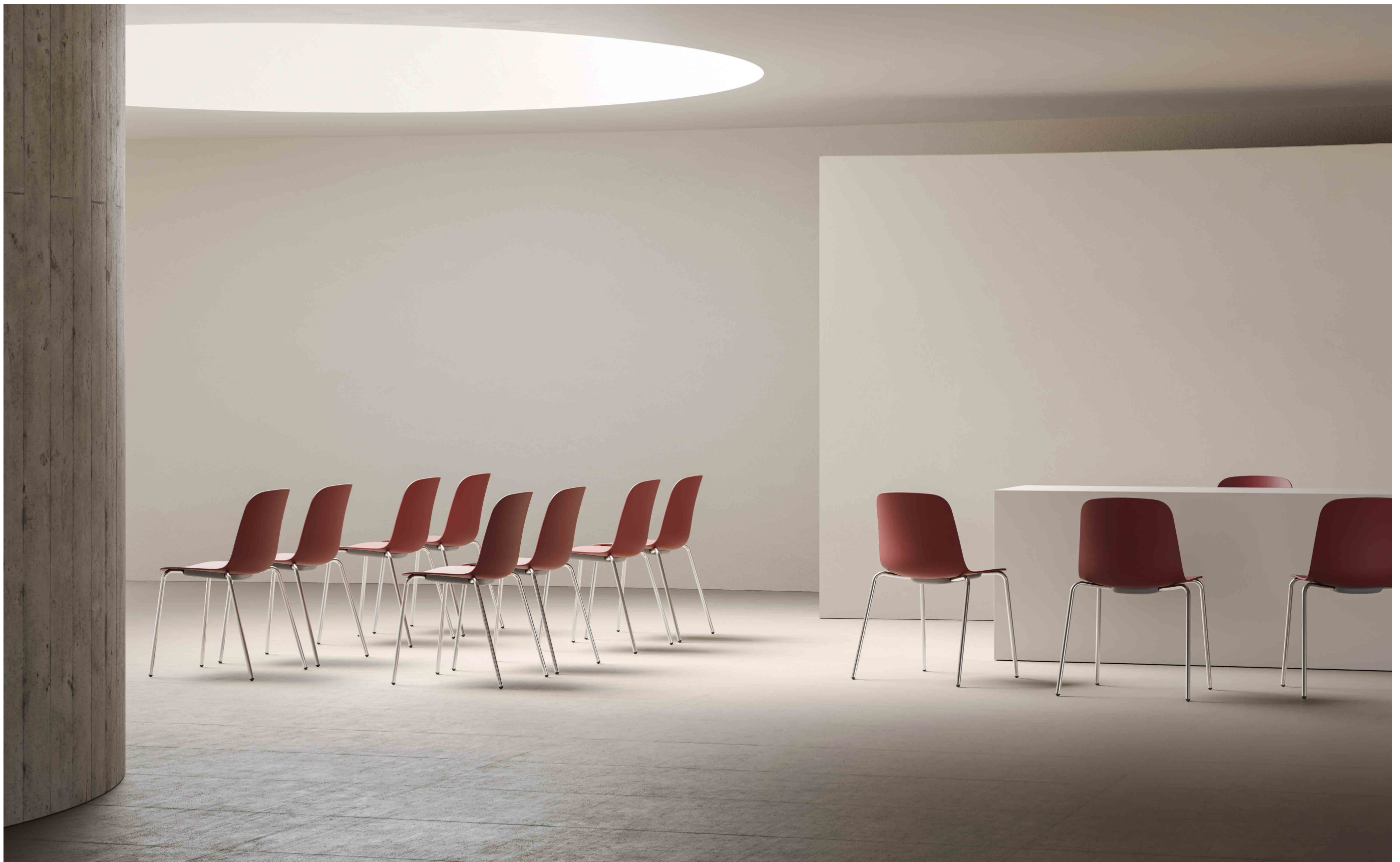
Four leg metal stackable chair Red - Chrome