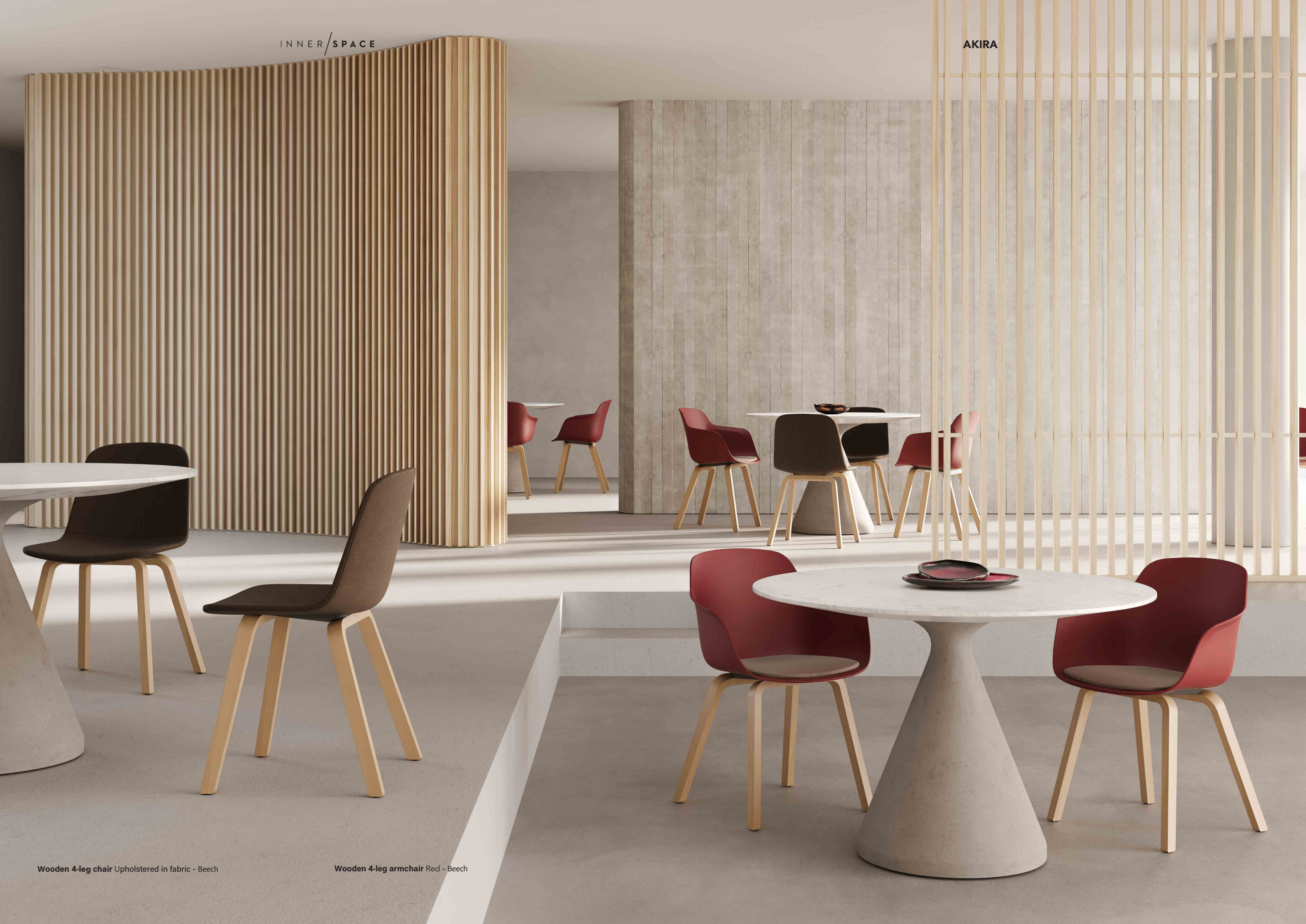
Wooden 4-leg chair Upholstered in fabric - Beech