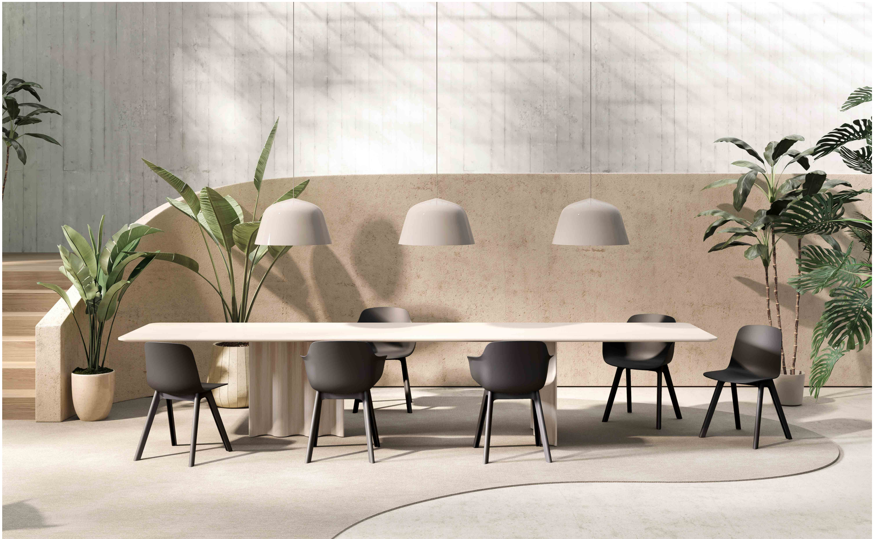
Polypropylene four leg chair Black - Charcoal