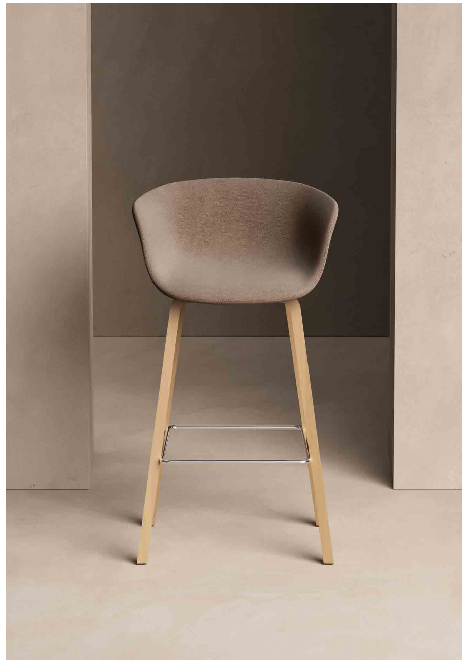
Wooden 4-leg frame barstool Upholstered in fabric - Beech