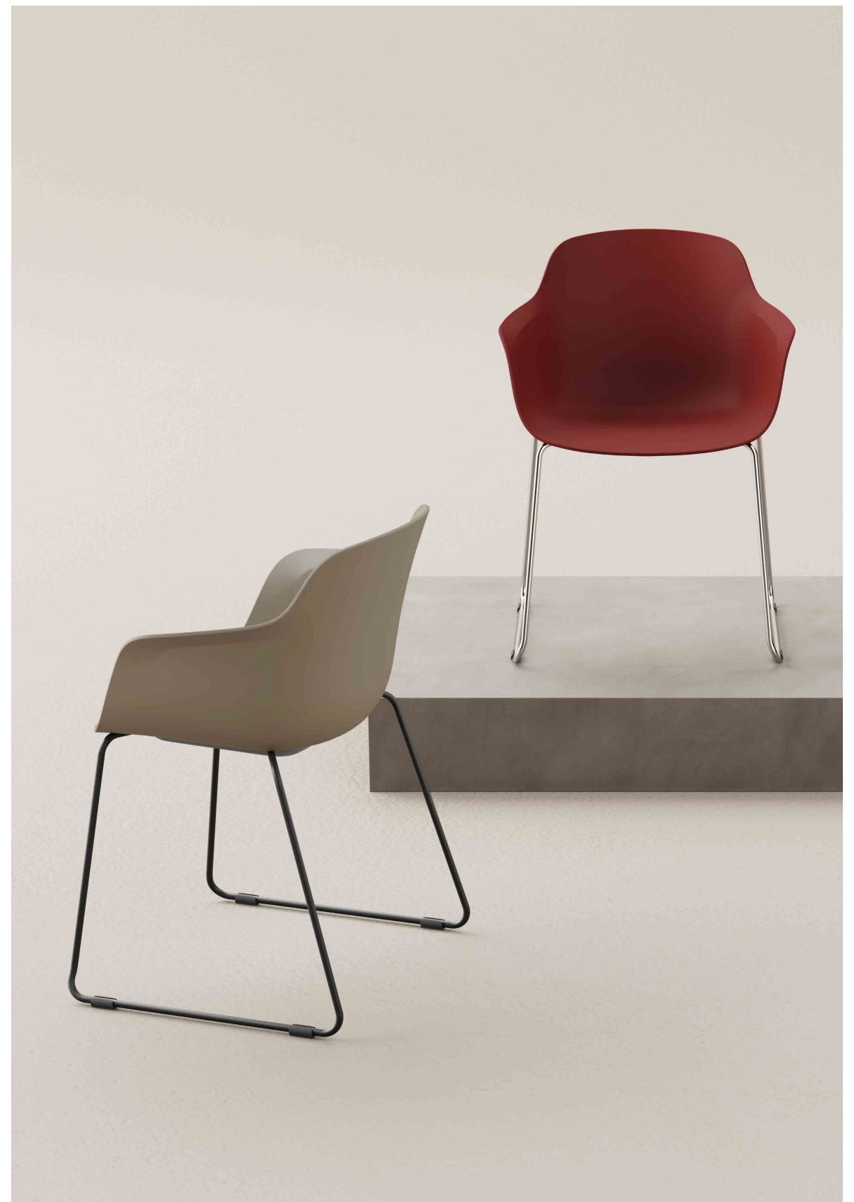
Sled base armchair Sand ECO - Black