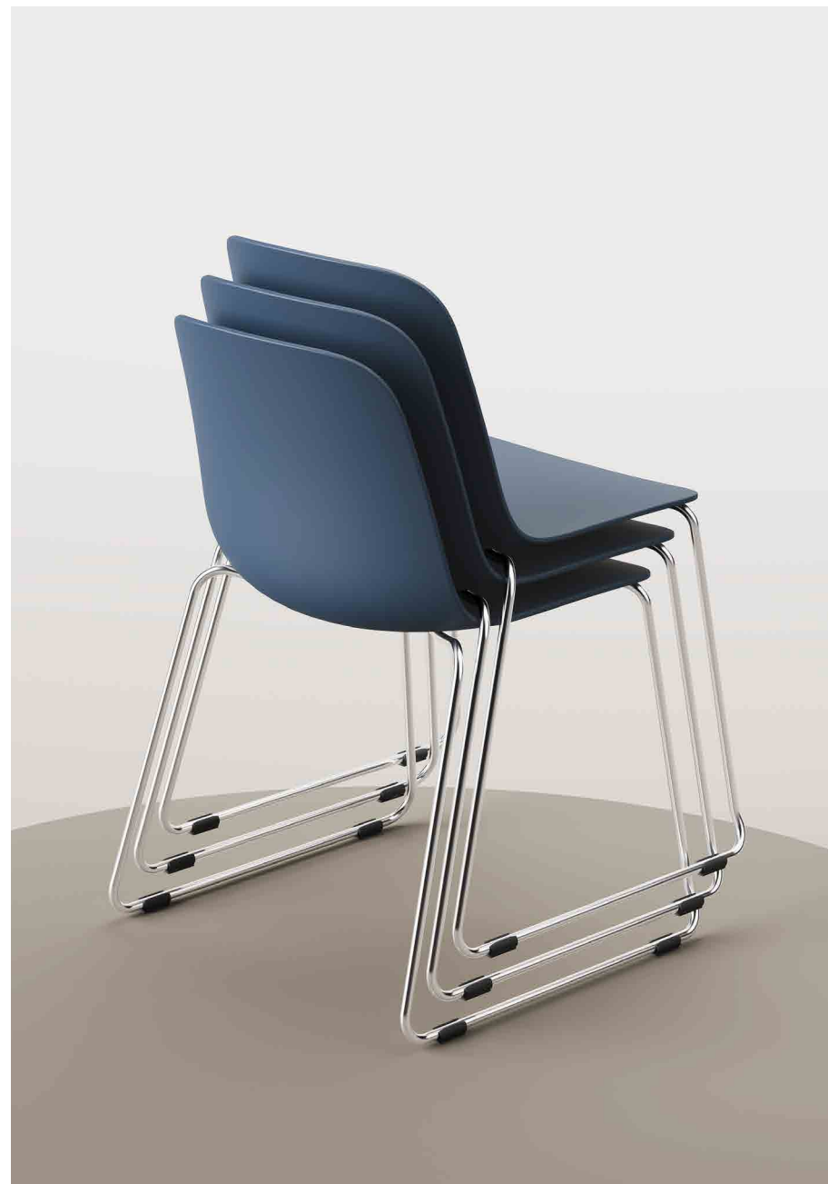
Sled base stackable chair Navy - Chrome