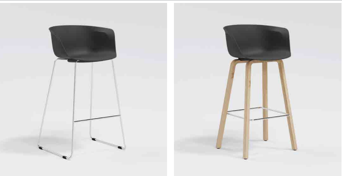
Sled base Wooden 4-leg frame