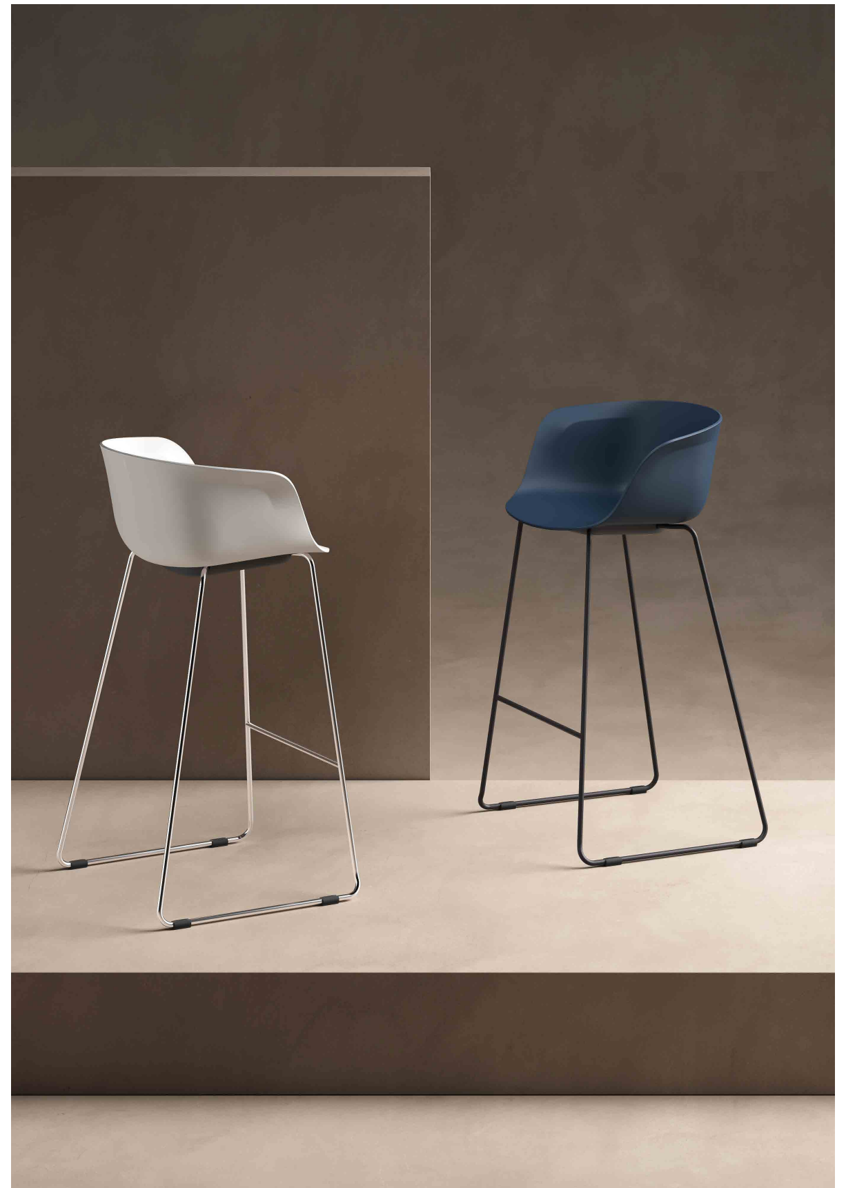
Sled base barstool White - Chrome