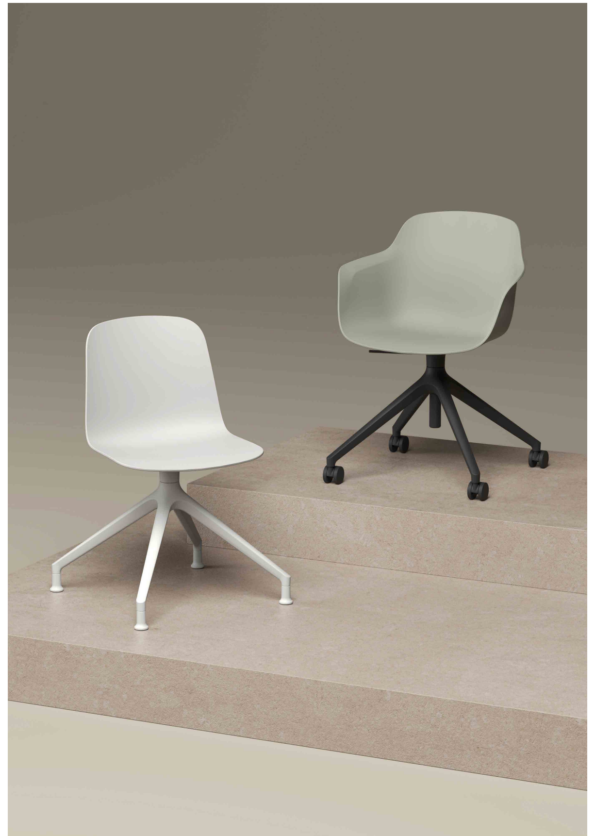
4-star base chair White- White