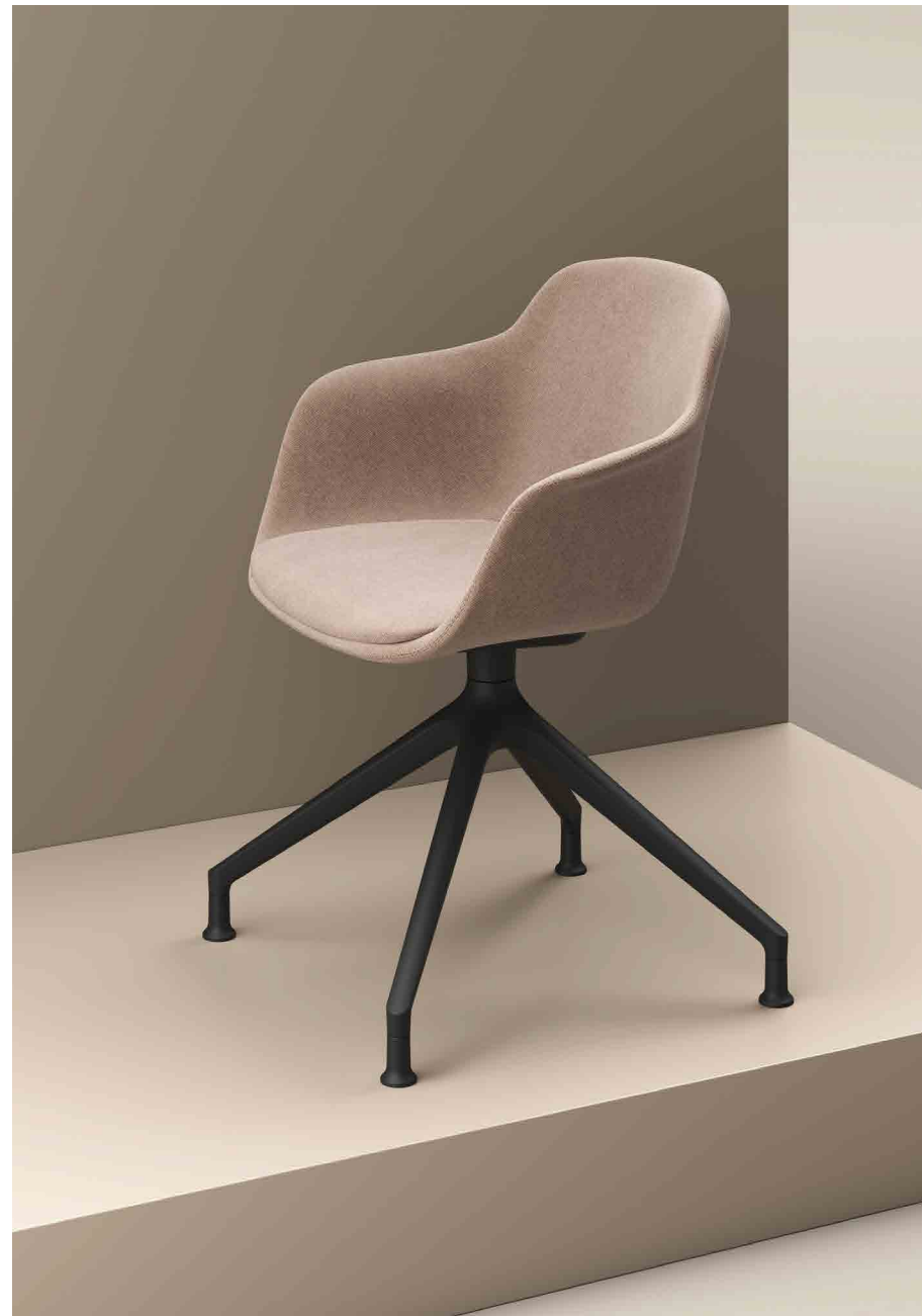
4-star base armchair Upholstered in fabric - Black