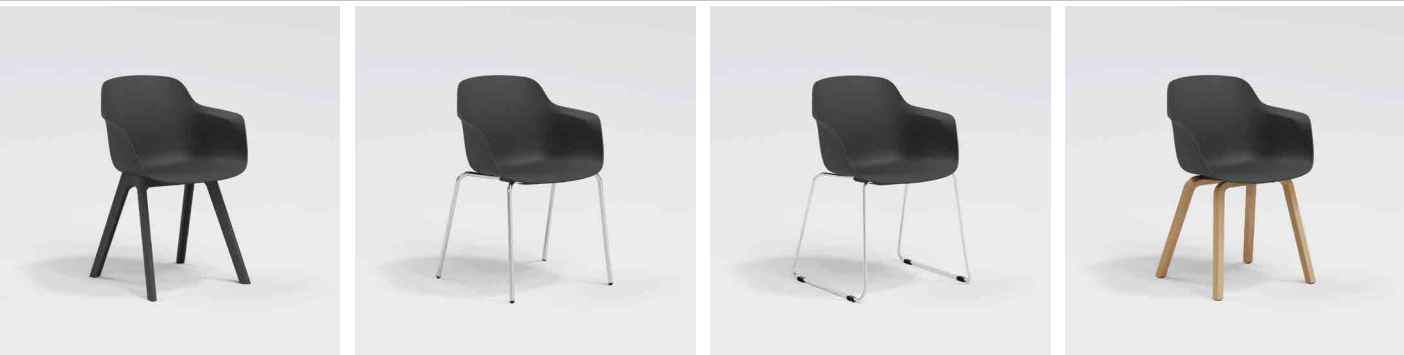
Four leg polypropylene frame Metal four leg frame Sled base Wooden 4-leg frame