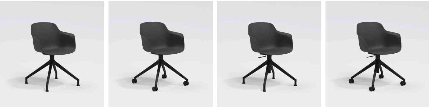
4-star base 4-star base with castors 4-star base with gas lift 4-star base with gas and castors