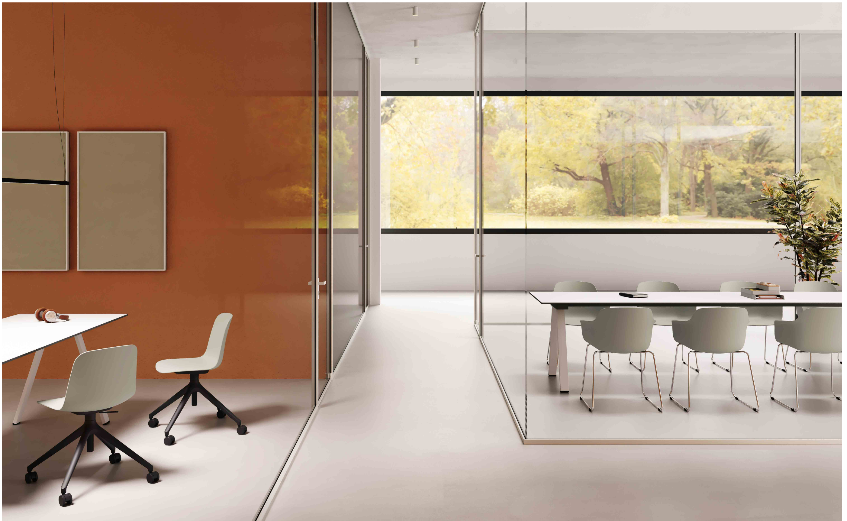
4-star base chair with gas and castors Mint - Black