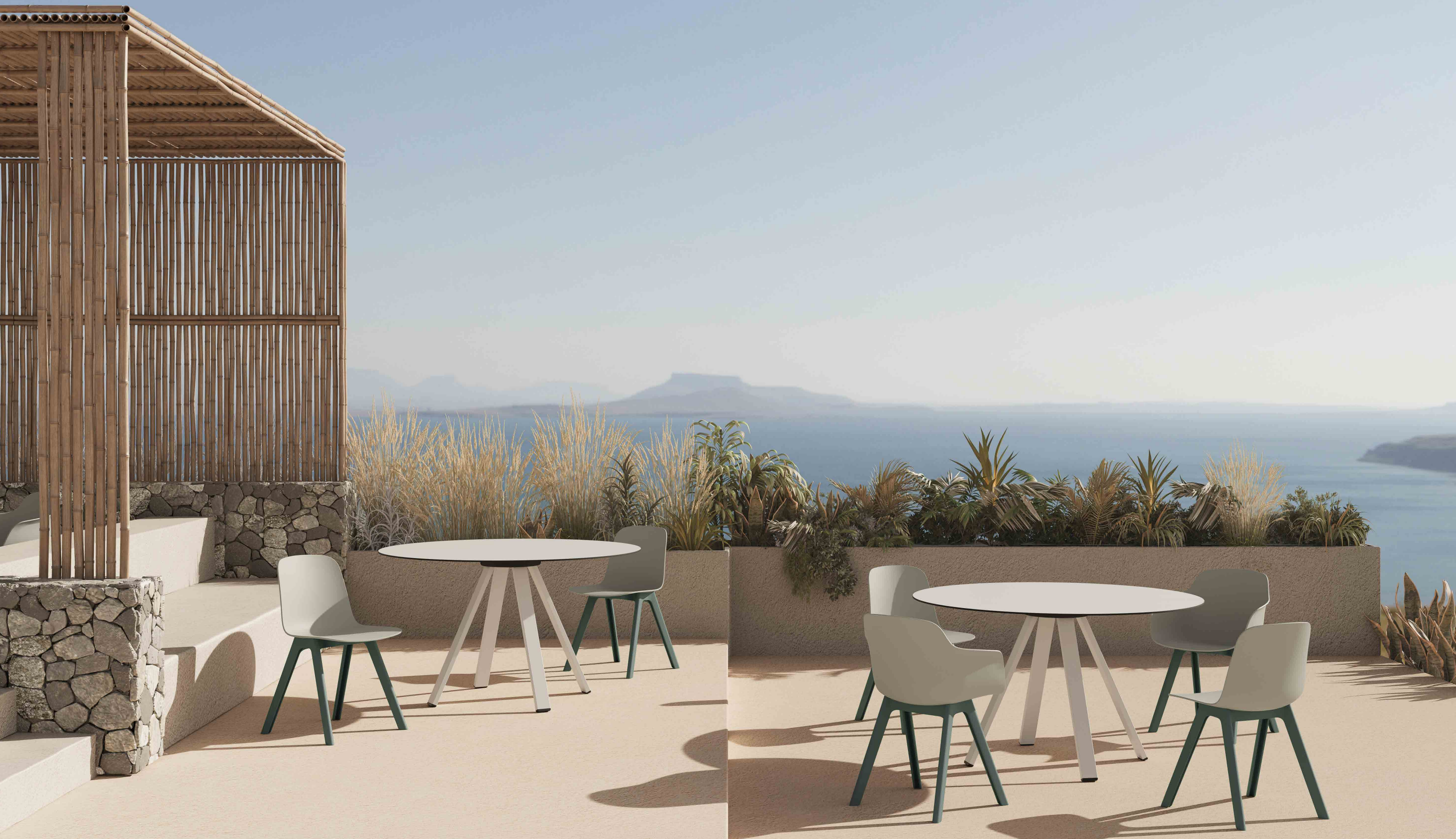
Polypropylene four leg chair Mint - Dark Green