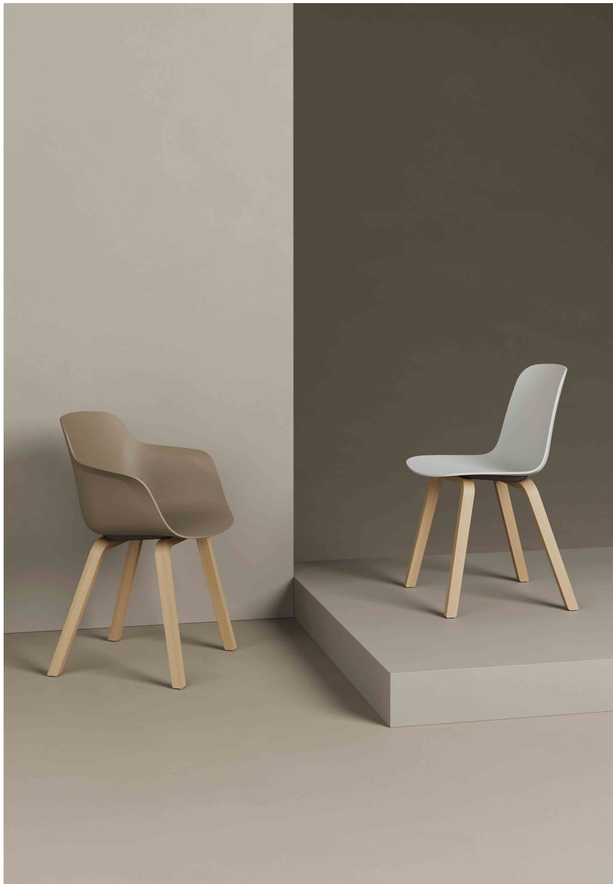
Wooden 4-leg armchair Sand ECO - Beech