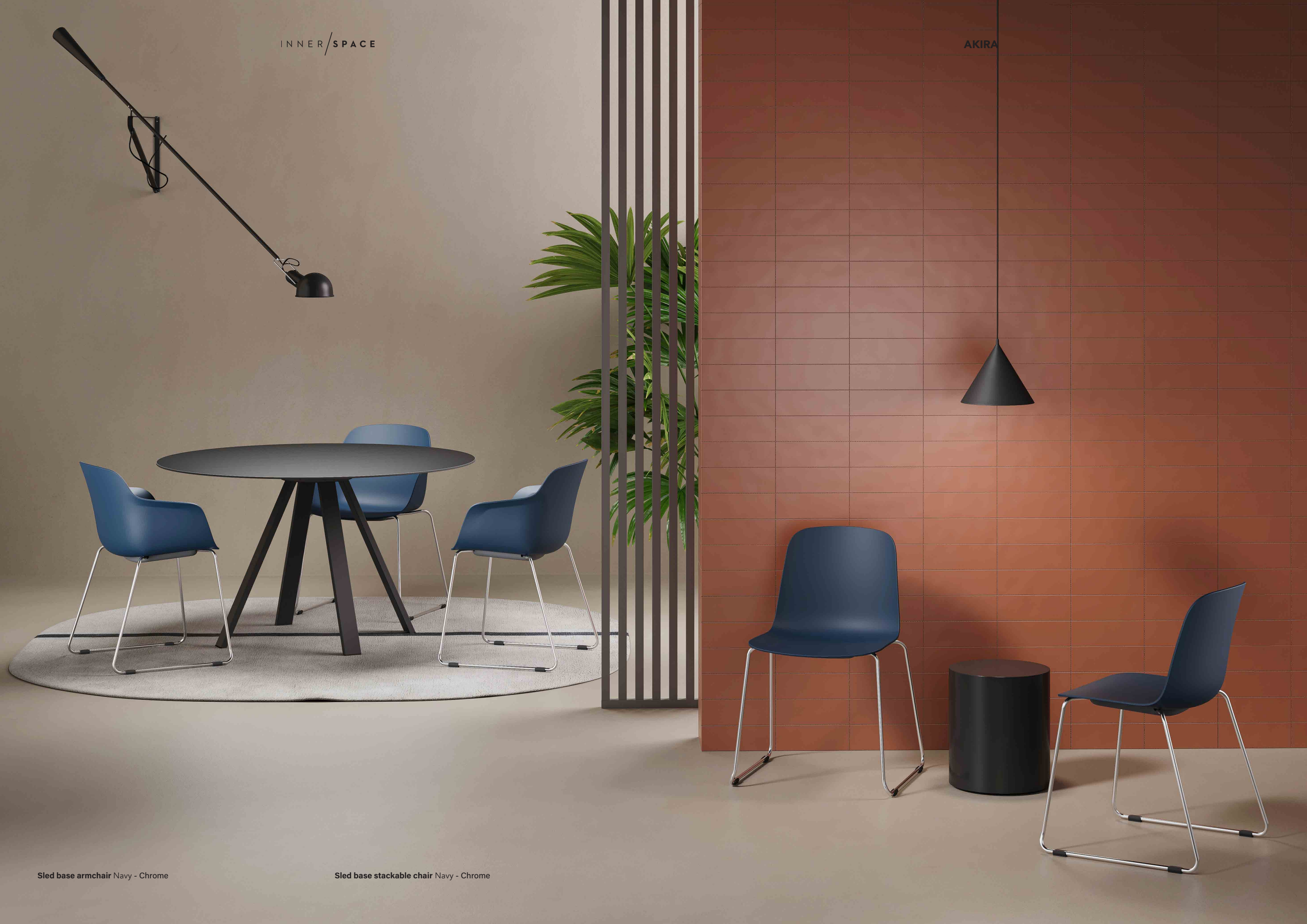
Sled base armchair Navy - Chrome