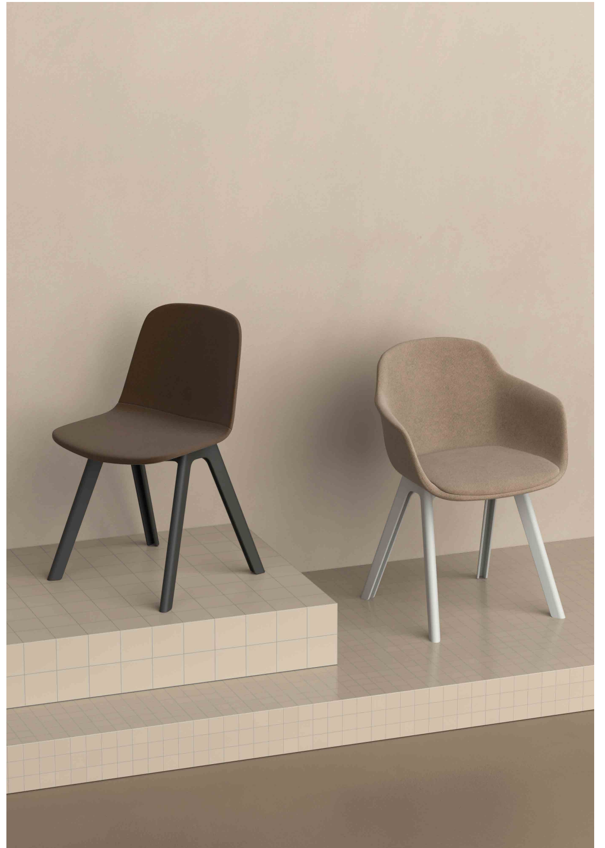
Polypropylene four legs chair Upholstered in fabric - Charcoal