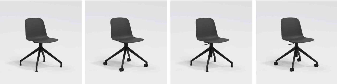
4-star base 4-star base with castors 4-star base with gas lift 4-star base with gas and castors