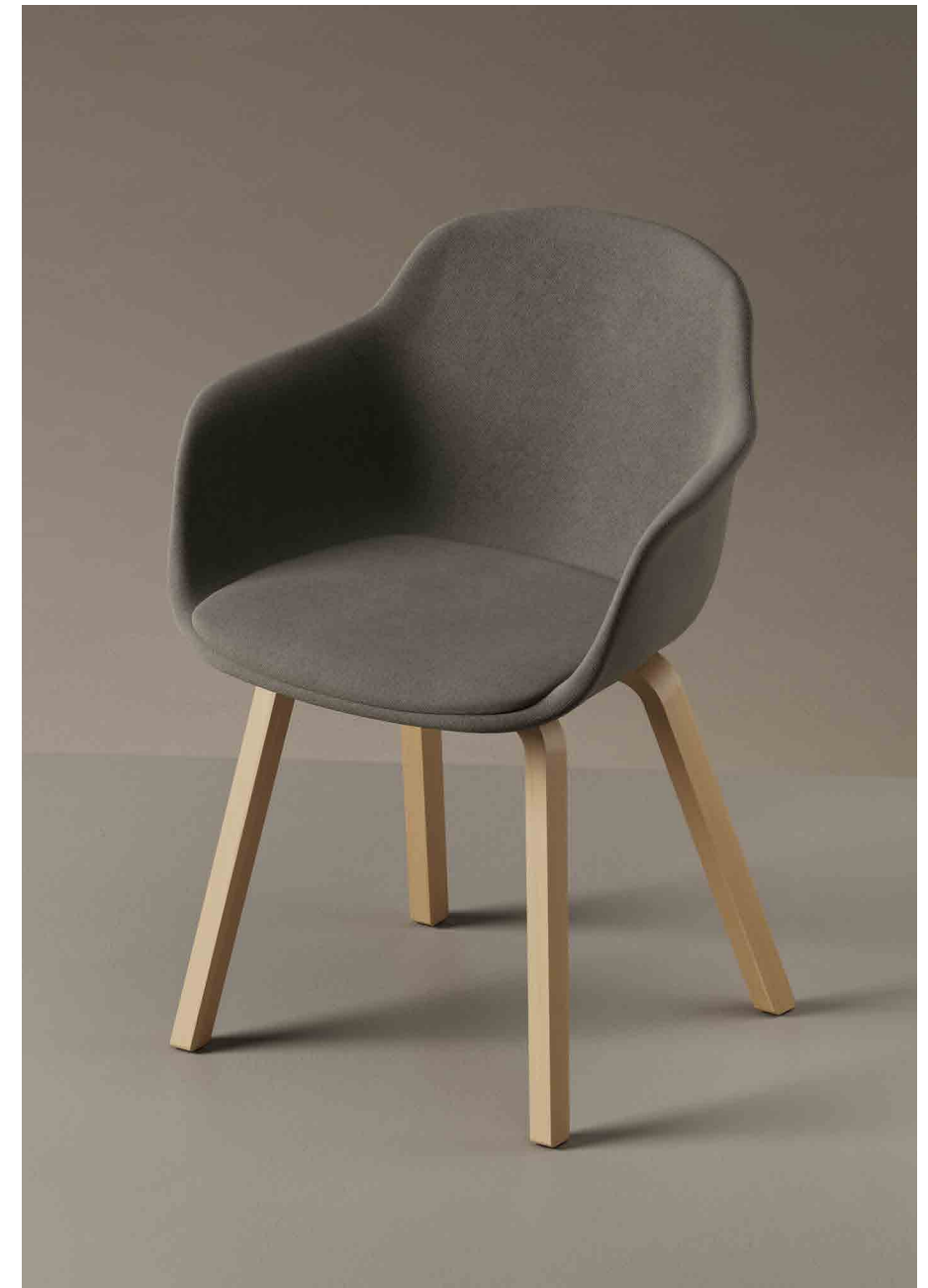
Wooden 4-leg armchair Upholstered in fabric - Beech