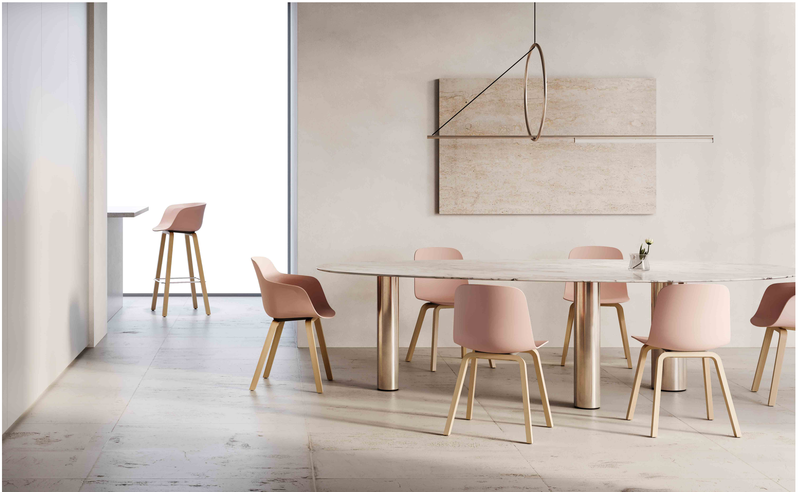
Wooden 4-leg barstool Pink - Beech