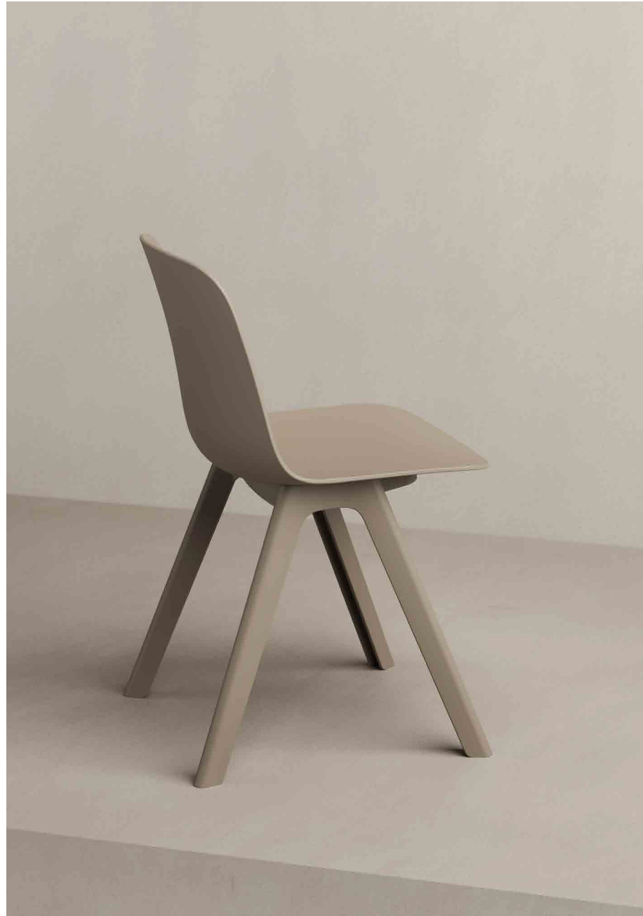
Polypropylene four leg chair Sand ECO - Sand ECO