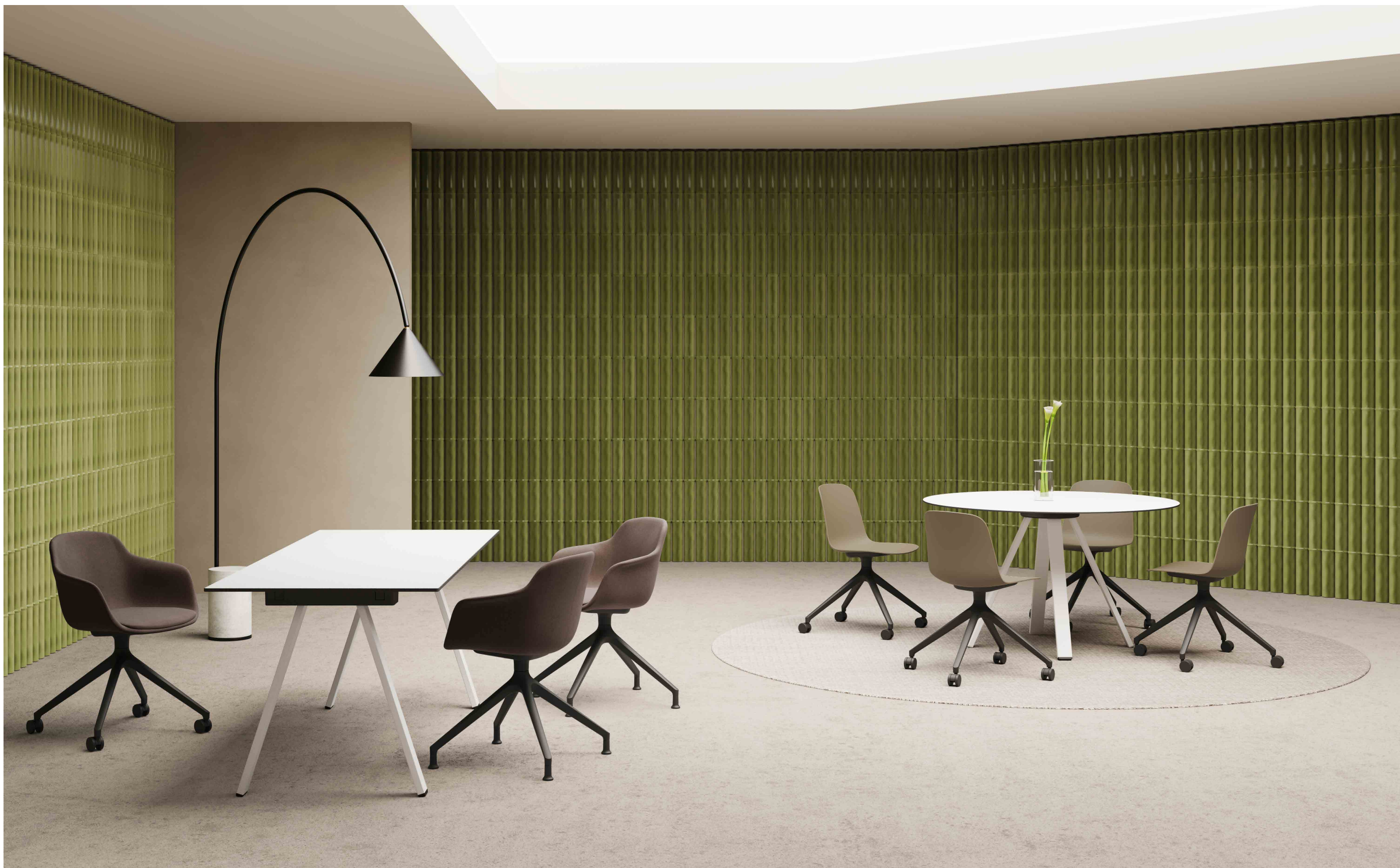
4-star base armchair with castors Upholstered in fabric - Black