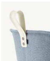
Oyster RAL 1013