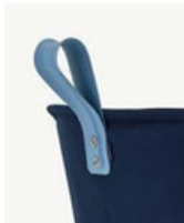
Pastel Blue RAL 5024