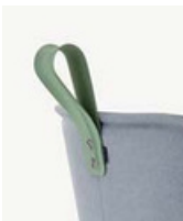
Pale Green RAL 6021