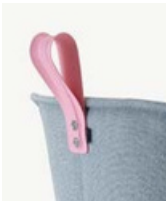
Light Pink RAL 3015