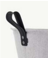
Black Grey RAL 7021