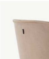
Without Strap Handle

The cold cure foam material has been tested to meet the following standards: