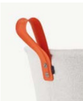
Traffic Orange RAL 2009